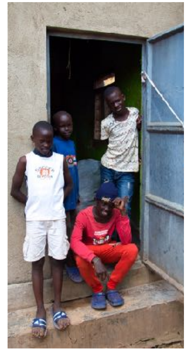
The Boys at their new home.