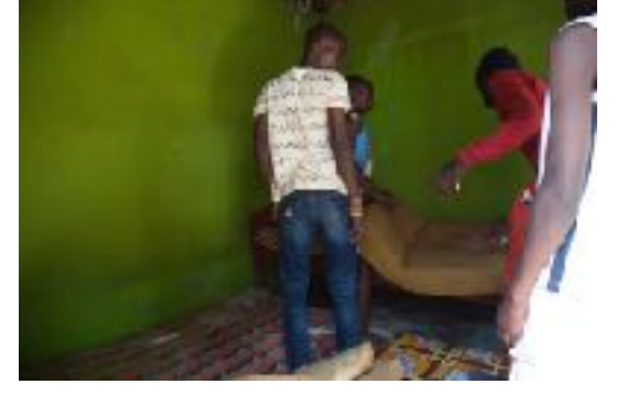
Inside the Boys new home.