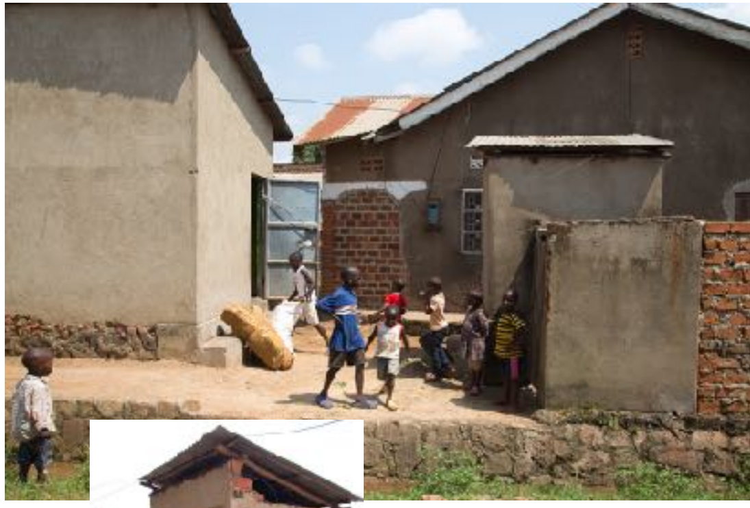
The Boys yard (above) and latrines (left).