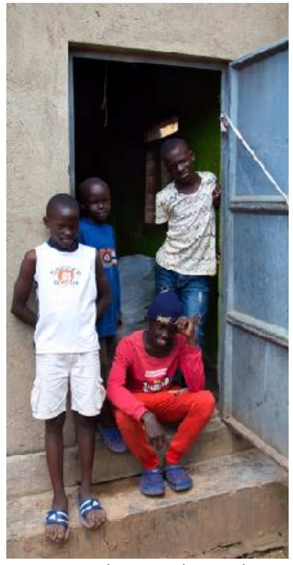
The Boys at their new home.

In addition to a training methodology, these 2 brothers had motorbike charts showing parts and assembly that the boys would be able to use to study the tasks. They even described a process by which the mechanic made an adjustment to a perfectly good bike and then let the apprentice practise a diagnosis and repair.